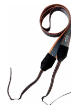
M1 hanging straps (TDR-420)