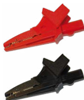
crocodile clip 1 kV 20 A red / black