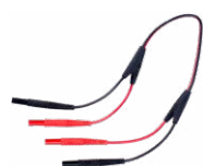
double-wire test lead 0.6 m