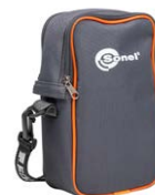
M-13 carrying case (TDR-410)